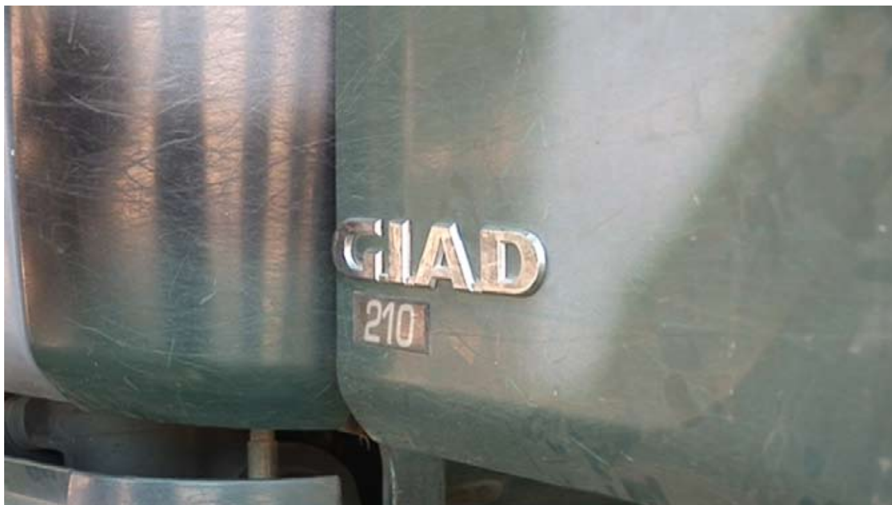
GIAD Truck (Darfur, Sudan) (Channel 4)

According to the Décret n°95-589 du 6 mai 1995 relatif à l'application du décret du 18 avril 1939 fixant le régime des matériels de guerre, armes et munitions 34 the trade in "[V]éhicules non blindés, équipés à poste fixe ou munis d'un dispositif spécial (affût circulaire d'armes de défense aérienne, rampes de lancement) permettant le montage ou le transport d'armes (art. 2)" needs to be authorized (art. 9) 35 . The authors have asked Renault 36 , the French Ministry of Foreign Affairs and French Customs 37 if an export licence was requested/granted. The Ministry of Foreign Affairs answered that these trucks "are neither on the military list nor on the dual-use list, so Renault was not obliged to apply for an export license until now". They did add, however, that they are open to discuss the issue and might take additional information into consideration to possibly put the trucks on the control list. 38 Renault replied: "These components being non military parts and Sudan undergoing no such embargo, we are not submitted to export licence application." 39 This brief has however clearly demonstrated