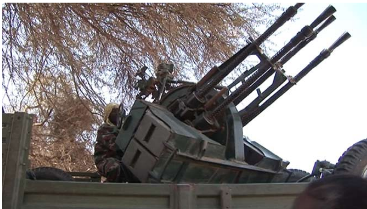
Truck with anti-aircraft gun (Darfur, Sudan)

Meanwhile, in their defence, Renault Trucks is arguing in mitigation that the Red Cross and the UN have also purchased Renault trucks for their operations in South Sudan and Darfur. This is a non sequitur since we are discussing the use of such vehicles by the Sudanese military and pro-government militias in Darfur. Moreover Renault claims that the Red Cross and the UN are using the services of a GIAD subsidiary to service these