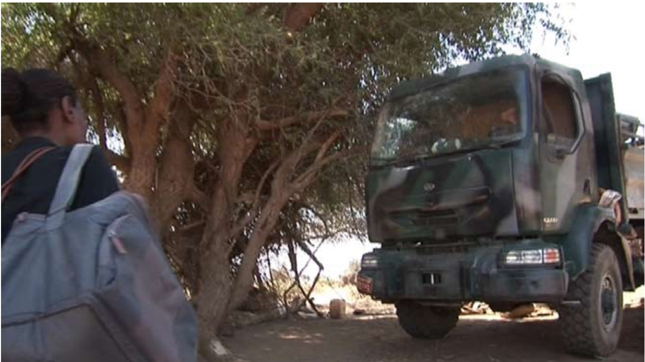
GIAD Truck (Darfur, Sudan)

The argument that the Renault Midlum belongs to the civilian range of construction trucks is not entirely true. The Renault Midlum, Kerax, etc. trucks have been advertised by Renault Trucks Défense as “véhicules